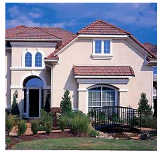
Build a Better Home for Less

To find out more; talk to our current owner-builders, attend one of our free seminars, and visit with one of our program consultants. Contact us at 936-321-2552 for an office near you.