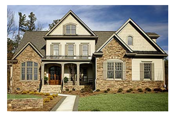
"Your Dream - Our Passion"

Proven System - Using our proven system and our recommended suppliers and subcontractors, one client, a 70 year-old retired school teacher, built her own home in 4½ months and saved thousands of dollars.